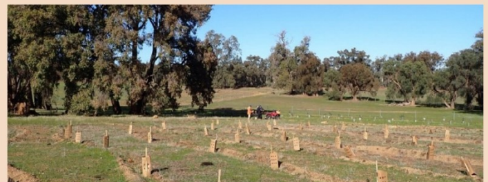
This project is supported by funding from the Western Australian Government's State NRM Program.