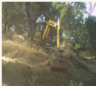
Bank works carried out in 2024