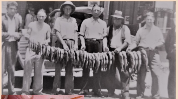
Above: English perch fished from the Hotham River

Reference: Redfin perch . Healthy Rivers. (2022, March 24). https://rivers.dwer.wa.gov.au/species/perca-fluviatilis/