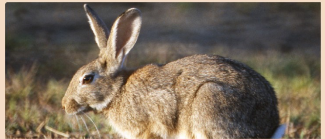
Image: European rabbit

Link: https://pestsmart.org.au/wp-content/uploads/sites/3/2021/03/CISS-Glovebox-Guide-Rabbit-web.pdf