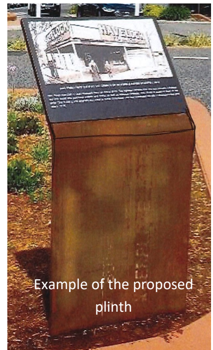
Example of the proposed plinth

Once the proposed walk trail is finalised a plinth will be installed outside each building, consultation with private residents will be undertaken first. The heritage walk project will not be completed quickly, manufacturing of the plinth, research of the history, graphic design of the plaques and then installation of the plinths will take time.