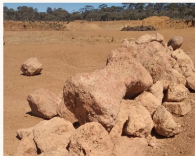
Rehabilitation material at Pumphreys Bridge and Williams Rocks kindly donated by Newmont