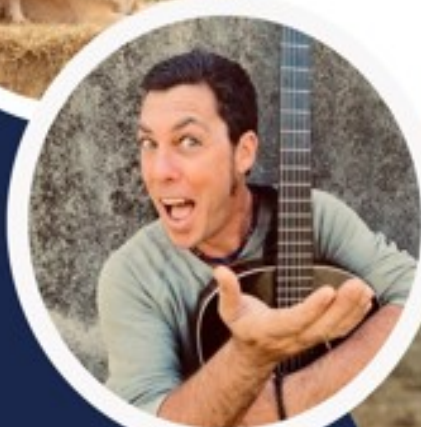
SPECIAL GUEST CHRIS MATTHEWS