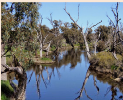
Hotham River, Pumphreys Bridge

Partnerships with Newmont and South32 Worsley Alumina are allowing PHCC to prioritise on-ground restoration works, which are being planned for mid-2022 (subject to relevant approvals). For other activities at the site such as stabilisation of the historic bridge and upgrading of the campground facilities, PHCC is looking forward to working directly with the Shire of Wandering who manages the popular recreational area.