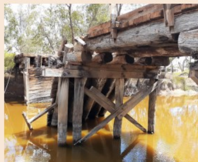
Old Pumphreys Bridge

COVID-19 We value the health and safety of our whole community and PHCC is now accepting visitors on an appointment basis only. Please contact us to make a booking via phone on 6369 8801 or 0455 166 780 or via email.