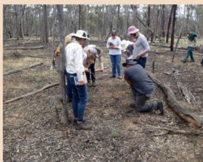
Workshop attendees learning how to identify numbat digs and scats