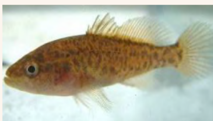
Photo of Swan River Goby

COVID-19 We value the health and safety of our whole community and PHCC is now accepting visitors on an appointment basis only. Please contact us to make a booking via phone on 6369 8801 or 0455 166 780 or via email.