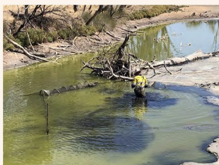
Photo of a fyke net set up in the Hotham River for survey of fish species

This is reflected in the tolerances and ranges of aquatic fauna including the Swan River Goby, or Pseudogobius olorum . This native species is a very specific yardstick for salinity levels, not because it disappears when salinity increases, but in fact it inhabits an area which has changed from freshwater to saline. Therefore, its presence further and further inland is directly related to the salinisation of inland river systems. The Swan River Goby can also tolerate extreme temperatures, and has a fast reproductive cycle, living for about a year and becoming sexually mature once they have attained 25 mm total length at five to seven months of age (Gill et al. 1996). It is amazing to think that their ability to reproduce and travel has taken them all the way to the Hotham River Nature Reserve, which is 185km from Mandurah!