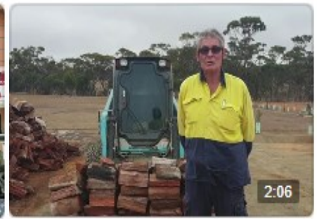
Harwood Contracting Services