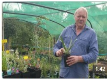
Things to Do in the Shire of Cuballing Popanyinning Nature Trail