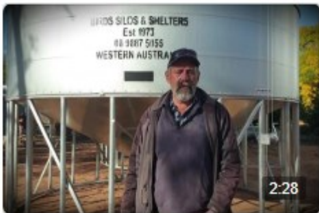
Birds Silos and Shelters