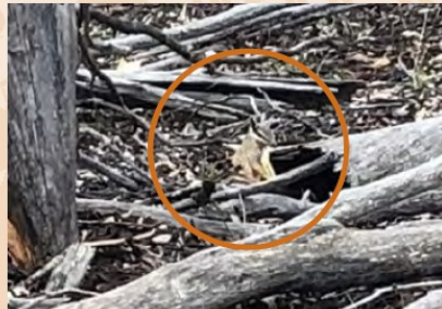
PHOTO: A Cuballing farmer snapped this little fella in Dryandra within 50 metres of his farm

We are keen to hear of feral animals culled and threatened species seen in your area. Please contact us to report and to obtain information on the support that PHCC can provide.