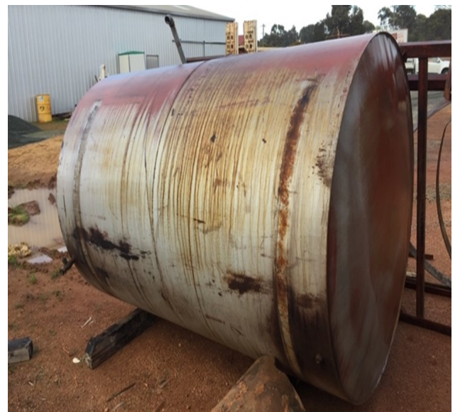
4,000 litre diesel tank and frame

Office Opening Hours: Monday—Thursday, 8.30am—4.30pm Friday, 8.30am—4.00pm