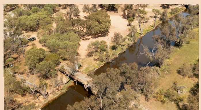
Pumphreys Bridge.