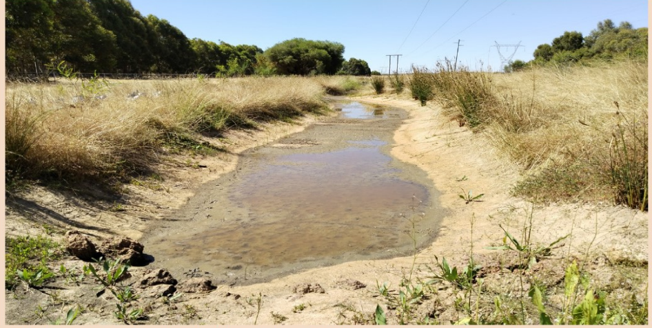
Structures like contour banks help retain water in the landscape, reduce water logging/salinity and make it available for production purposes

This workshop will be delivered by the Peel-Harvey Catchment Council in partnership with the Mulloon Institute and RegenWA with funding from Lotterywest. RegenWA is powered by the Perth NRM Collective Impact Program with funding from Lotterywest and Commonland.